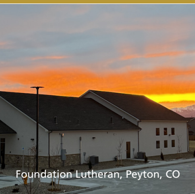
Foundation Lutheran, Peyton, CO