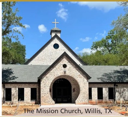
The Mission Church, Willis, TX