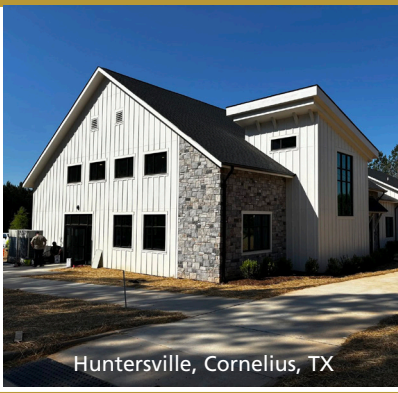
Huntersville, Cornelius, TX